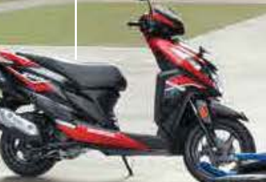
Mat Marvel Blue Metallic