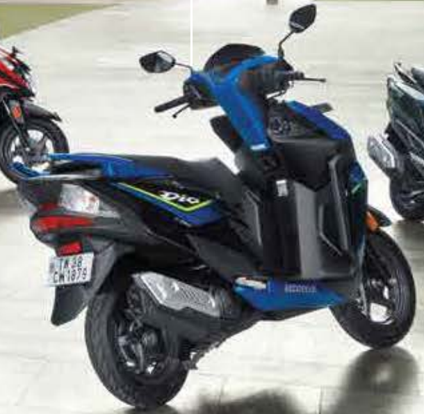
Pearl Siren Blue