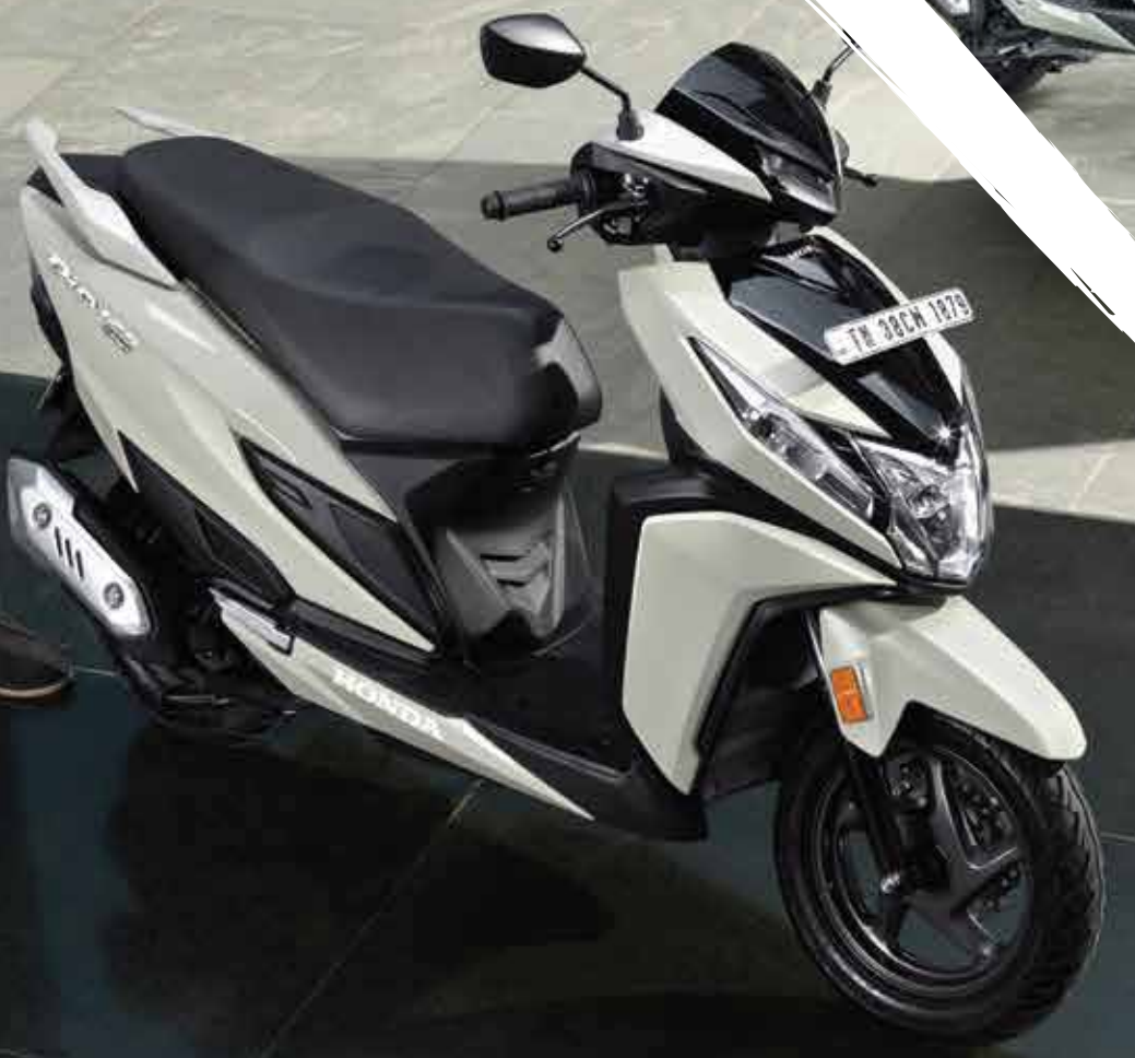
Pearl Deep Ground Gray with Graphics