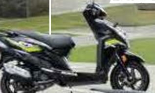
Pearl Deep Ground Gray